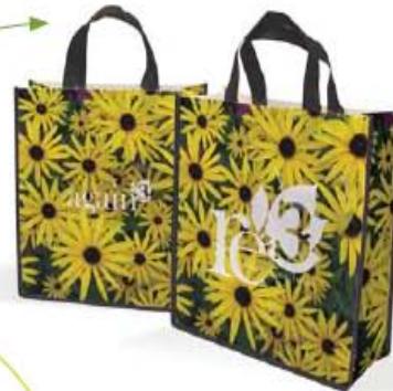
Non Woven PP Laminate (RPET Laminate also)