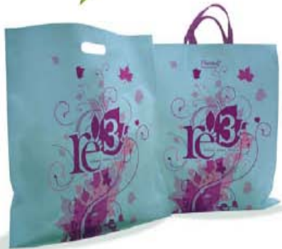
Non Woven PP 'Flexisoft'