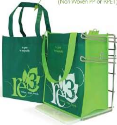
E-Bag (Non Woven PP or RPET)