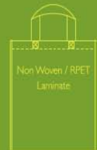
13" x 14.25" x 7.25"

prestige solutions achieving high impact appeal