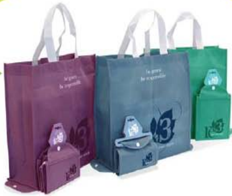
Non Woven PP Fold-a-Tote (Design variations)