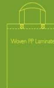
13" x 14.25" x 7.25"