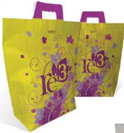
Woven PP 'Autote'