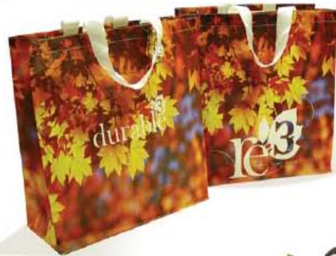
Woven PP Laminate