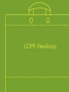
17.25" x 17.25" + 7"