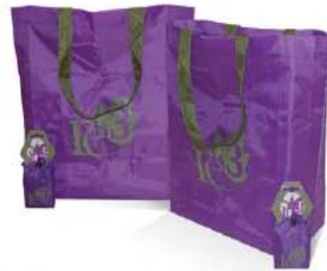
Polyester bag with integral pouch